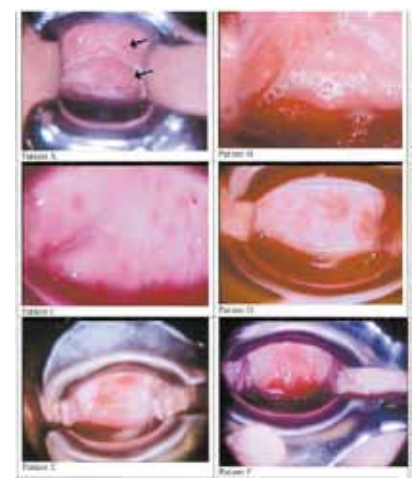
Figure 1. Aerobic vaginitis inflammation . Clinical pictures adopted from Donders et al , 2002, demonstrates patients with moderate to severe AV. Discrete (Patients A & B), moderate (Patients C & D), and severe ulcerations (Patients E & F) are observed along with yellowish discharge and inflammation of the vagina. (1)

The patient may present with all or some of these signs and symptoms of AV: yellowish discharge, itching or burning sensation, dyspareunia, absence of the fishy odor (negative amine test) typically associated with BV, inflammation ( Figure 1 ), toxic leukocyte infiltration, and the presence of parabasal cells and naked rounded vaginal epithelial cells ( Figure 2 ).